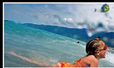
MY BEST HOLIDAY IMAGE