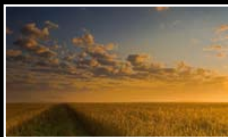
THE COMMODITIES OF BEER CULTURE