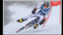
DYNAMICS / SPORTS