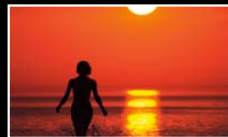
SUNRISE / SUNSET